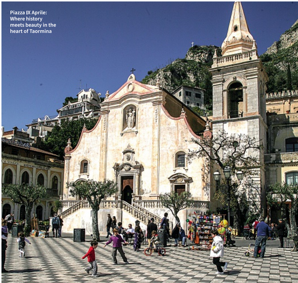
Piazza IX Aprile: Where history meets beauty in the heart of Taormina