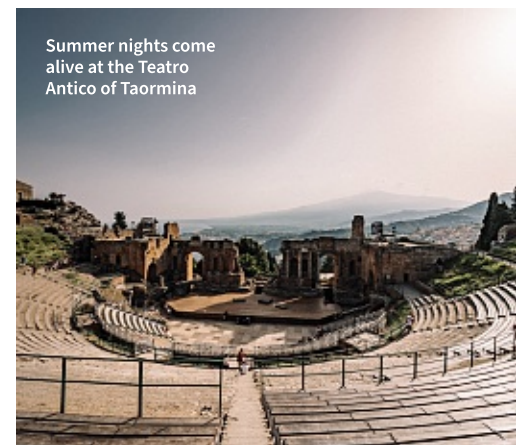
Summer nights come alive at the Teatro Antico of Taormina